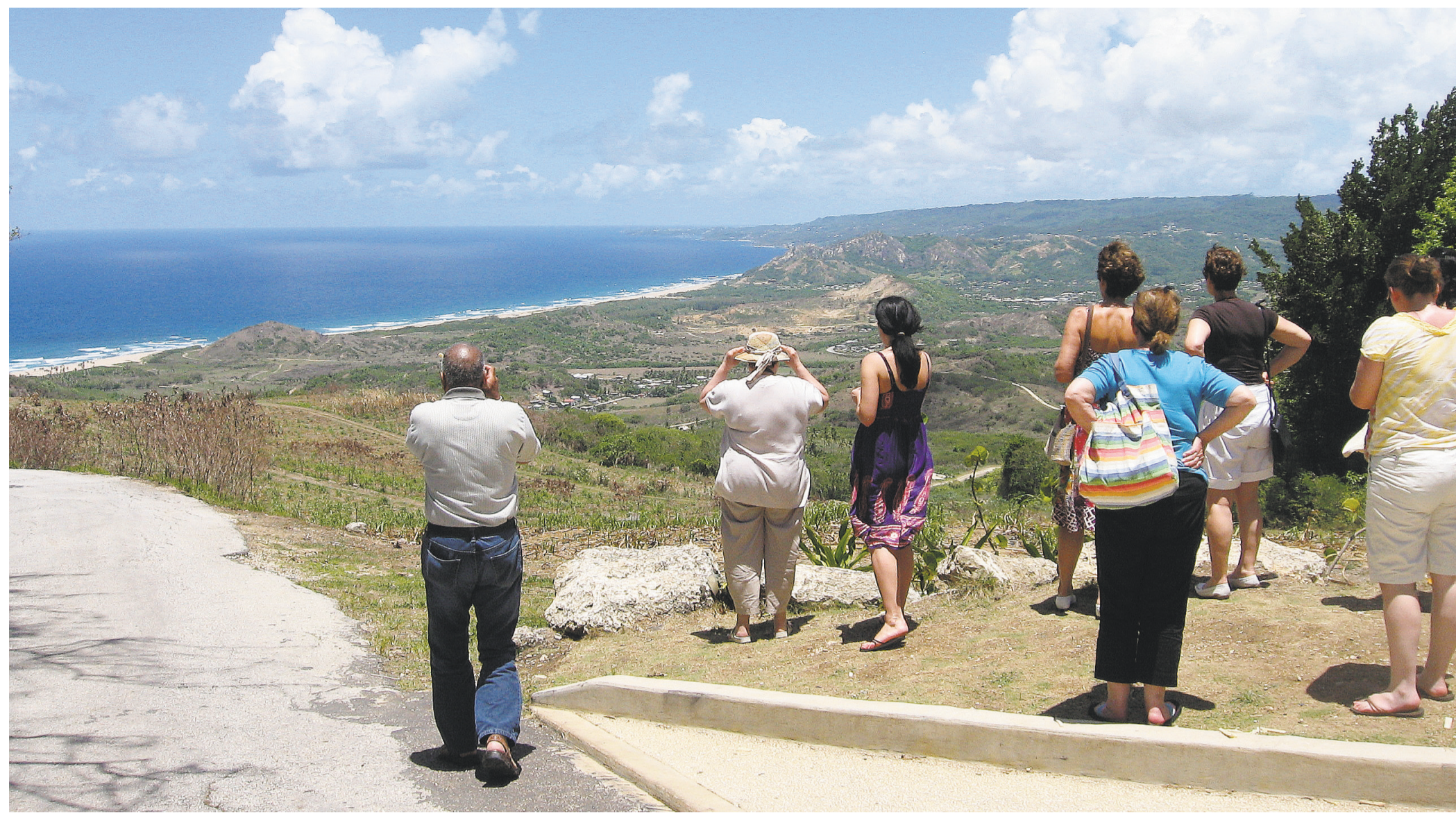
Cherry Tree Hill lookout, which rises 259 metres, offers a spectacular view of the Scotland District and Atlantic Ocean. Add some rum punch and the enjoyment of the scene improves dramatically.